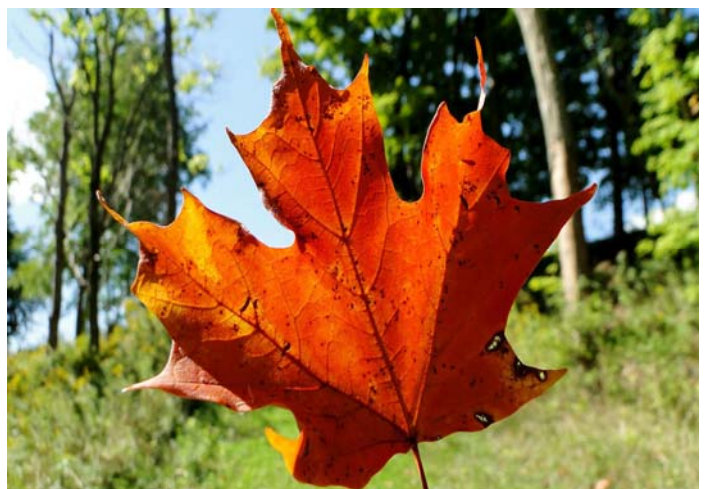
Amber Wick, Cattaraugus-Little Valley CSD Crisp Autumn