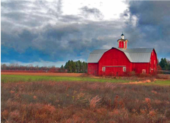
Devon Allen, Lyndonville CSD Lyndonville Community Red Barn