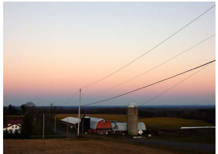
Emilie Robbins, Carthage CSD Country Farm, Deer River, NY