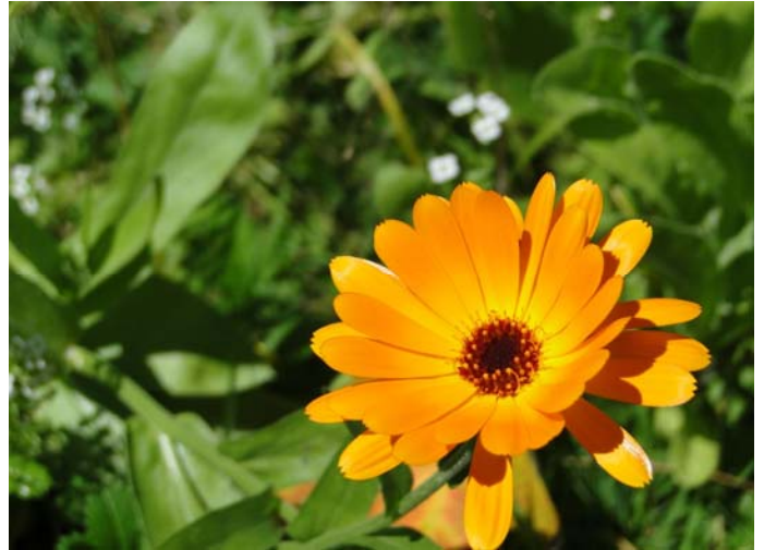
Brianna Campbell, Cattaraugus-Little Valley CSD Flower