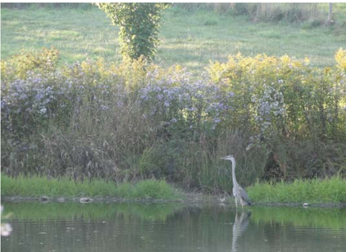
Kaitlyn Parmenter, Cattaraugus-Little Valley CSD Backyard Elegance