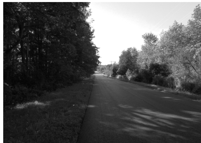
MaggieVeiga, Carthage CSD Tree Lined Back Roads of Carthage