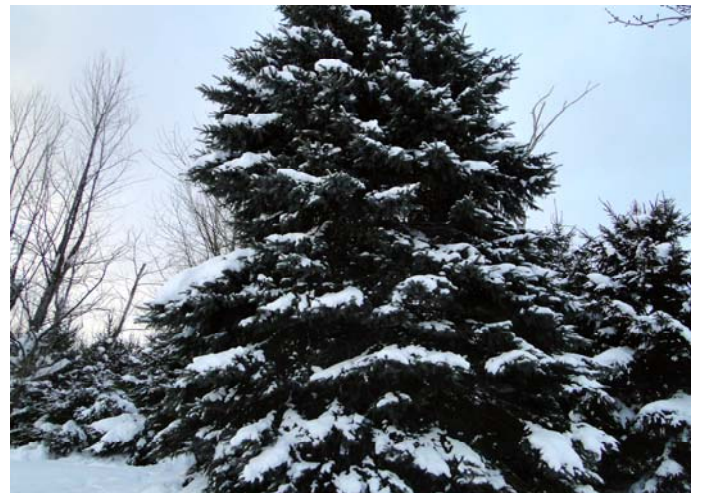
Brady Hill, Cattaraugus-Little Valley CSD The Weight of the World