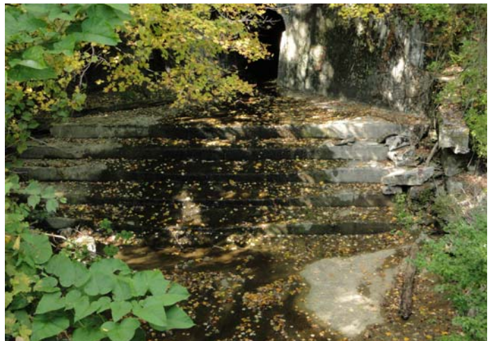
Ian White, Cattaraugus-Little Valley CSD Creek