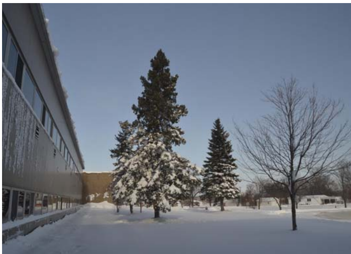
Shelbie Buskey, Carthage CSD Snow Covered School