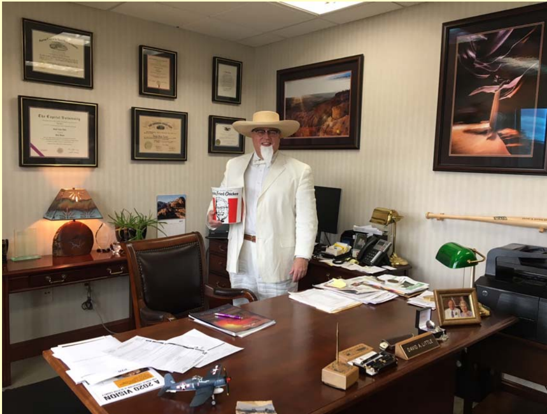
The Colonel visited the RSA Latham office on Halloween!