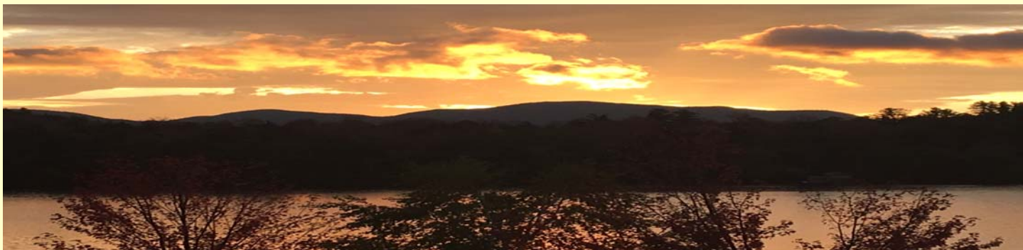
The sun rises over the Adirondacks' Mirror Lake on the final day of the Rural Schools Strand at the annual NYSSBA Convention.

Your Rural Schools Association is expanding programs for rural school leaders like never before! In addition to the annual Summer Conference, RSA just completed the Rural Schools Summit and strand of programming at the Lake Placid Convention Center. This learning opportunity was held in conjunction with the New York State School Boards Annual Convention and Education Expo. Rural school leaders had the opportunity to learn about rural education topics as far ranging as how video gaming can be used to promote educational outcomes to how the Community School model can be used to address rural community and student needs. With this RSA-NYSSBA collaboration, for the first time attendees at the NYSSBA Convention had the chance to focus all of their learning sessions on rural-specific issues, programs and services.