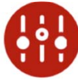
ALL DATA TOOLS