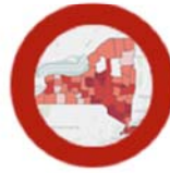
FEATURED DATA TOOL