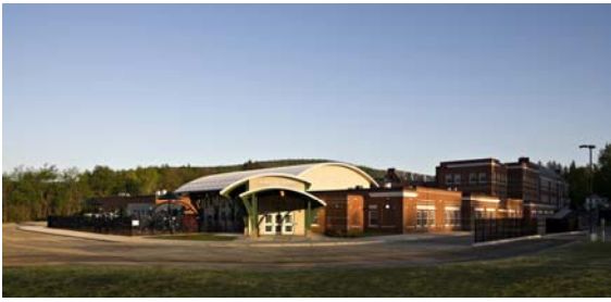
Worcester Central School District