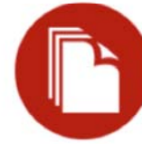
RESEARCH & PUBLICATIONS

Announcing an enhanced website ( http://NYEducationData.org ) building on the success of the Data Tools section of the NYS Center for Rural Schools website. As you may remember, from 2010 thru 2016 the New York State Center for Rural Schools with the support of the Rural Schools Association made a concerted effort to develop, publicize, and support a set of data tools (fiscal, demographic, and performance) that were useful to school and community leaders across NYS. We invested many, many days between 2010 to 2014 speaking to JMTs, BOCES, School Board Associations and the Rural Schools Association about the tools and seeking feedback for how we can enhance them be more timely and useful for practicing school district leaders. During the past six years, the site ( nyruralschools.org ) averaged about 3500 visitors, 20,000 visits, 50,000 pages viewed, and 90,000 hits PER MONTH.